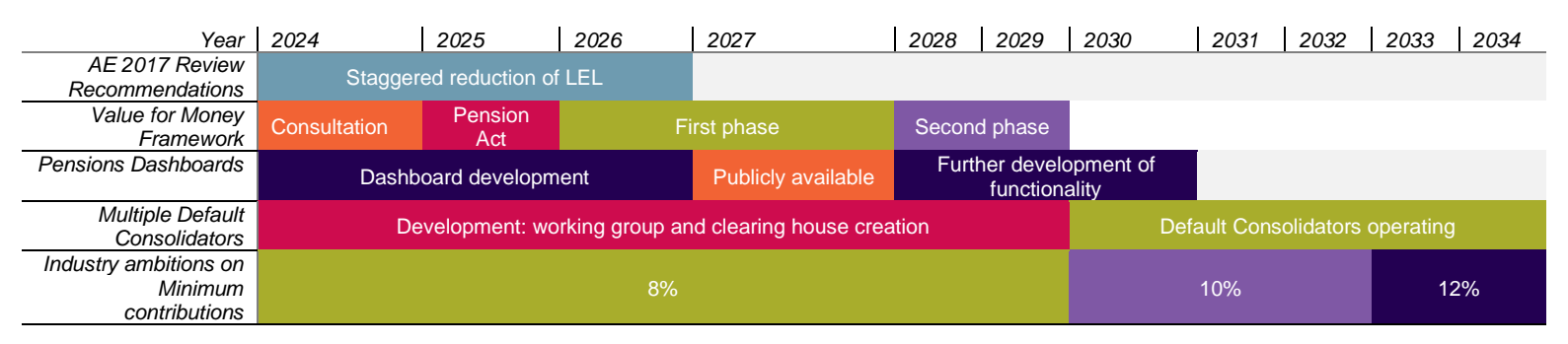
Figure 1: Policy development matrix